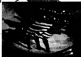
Salt Lake City, 8 February 2002. Opening Ceremony: American athletes hold the American "Ground Zero" flag from Manhattan, New York.