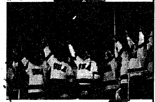
Salt Lake City, 8 February 2002. Opening Ceremony: the former American hockey team, Olympic champions in 1980, lit the cauldron of the Olympic flame.